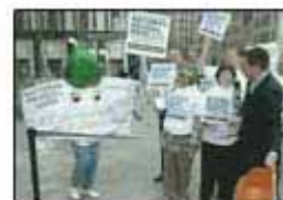
The NPW Dancing Paycheck cut a rug on CBS' "The Early Show."

Thanks to you, NPW 2008 was everywhere! When APA asked, you responded yet again in resounding fashion! While the annual "Getting Paid In America®" survey logged in more than 45,000 people, NPW's various advertisements reached a worldwide audience. NPW even stirred up a fun rivalry between talk show hosts, Jon Stewart and Stephen Colbert. Learn more about the impact of NPW 2008!